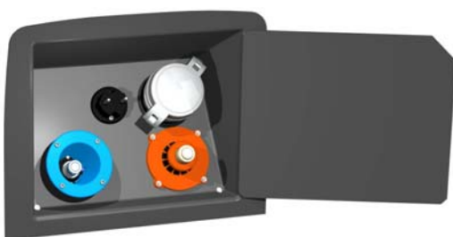
Example of the spill-free AdBlue® coupling mounted on a bus next to a spill-free coupling for diesel.

IDENTIC's spill-free solution includes a level sensor mounted in the vehicle tank which ensures that AdBlue® is filled to an optimal level every time, thus avoiding overfills. The level sensor is connected to a Vehicle Control Module (VCM) which communicates wirelessly with the dispenser equipment to control pump operation. All components are made of specially selected materials which are compatible with AdBlue®.