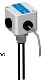
Integrated VCM and Level Sensor

Note: The vehicle control module and the level sensor are also available as one integrated unit. Please contact IDENTIC for more information.